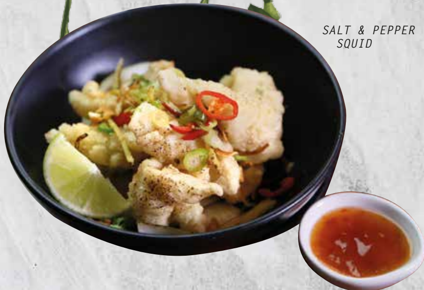
SALT & PEPPER SQUID