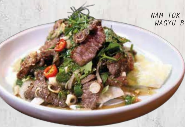
NAM TOK WAGYU BEEF