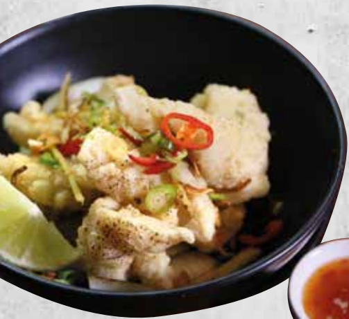
SALT & PEPPER SQUID