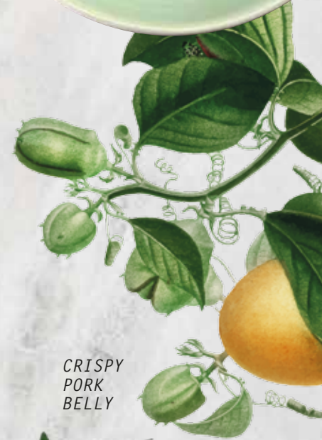
CRISPY PORK BELLY