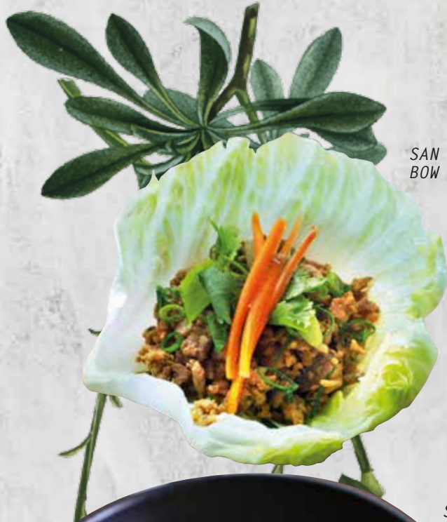
SAN CHOY BOW