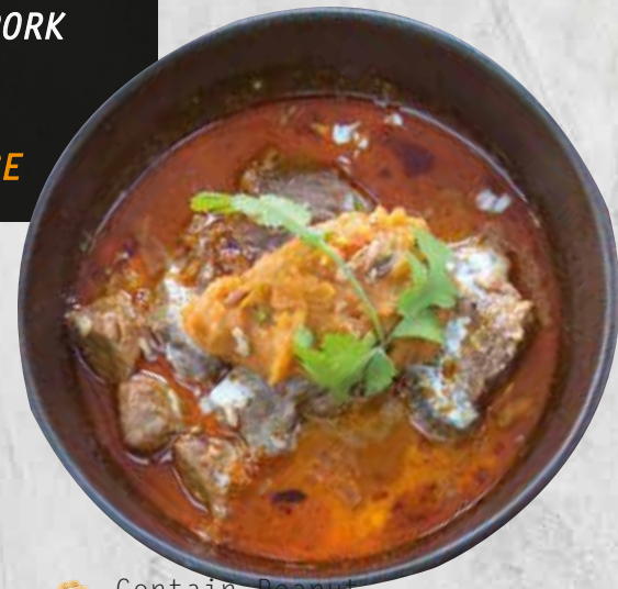
MASSAMUN BEEF CURRY